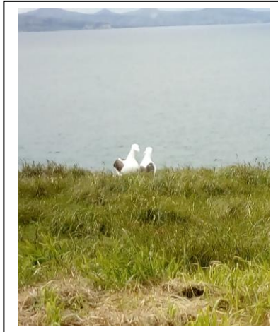
These 2 teenagers dropped in to say hello while we were checking out the Disappearing Gun at Tairoa Heads.