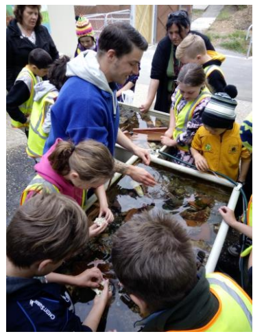
The children exploring the sea creatures at the Aquariums touch tank.