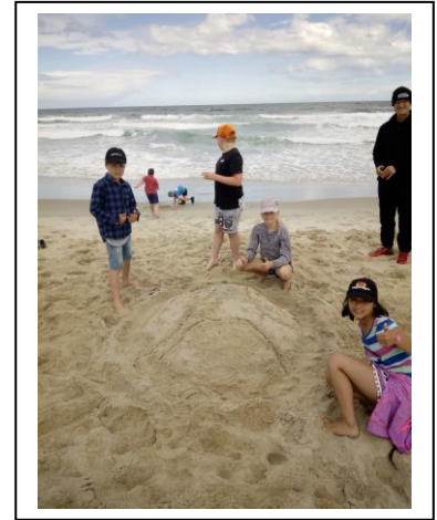
Giant football sand sculpture being created on St Kilda beach.